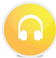
Malaysian Business Radio