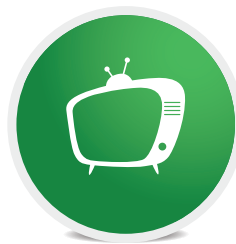
Malaysian Business TV