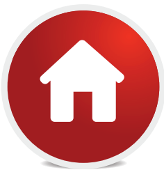
Malaysian Business Event