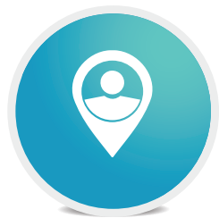
www.malaysian-business.com Online News portal