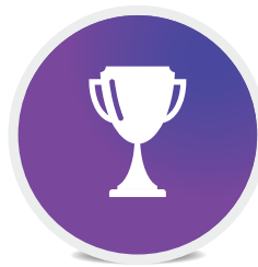
Malaysian Business Excellence Awards