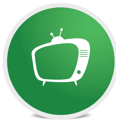
Malaysian Business TV