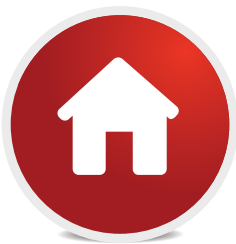
Malaysian Business Event