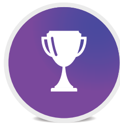
Malaysian Business Excellence Awards