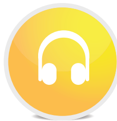
Malaysian Business Radio